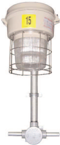
GEBT-25 with two 3/4" feed-thru hubs and one 1-1/2" vertical hub

Typical Applications: Coal Conveyors, Cat Walks, Platform Hand Rails